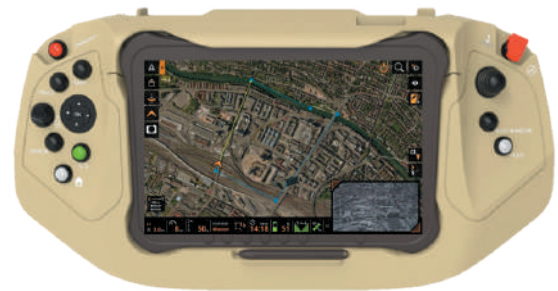
GCS with “NEVO”- an advanced mission SW